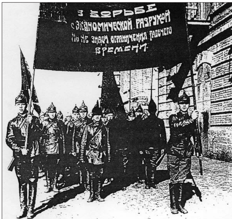
[A photograph showing members of the Cheka marching in a Communist rally in 1921. The banner reads "To avoid economic ruin everyone must work longer hours"]

Use Source A and your own knowledge to describe the role of the Cheka in the early years of Communist Russia. [6]